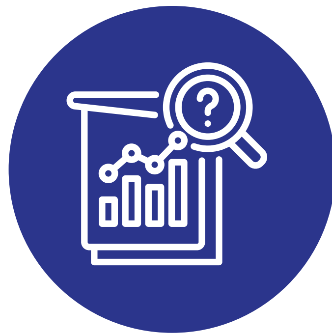
Objectives & questions